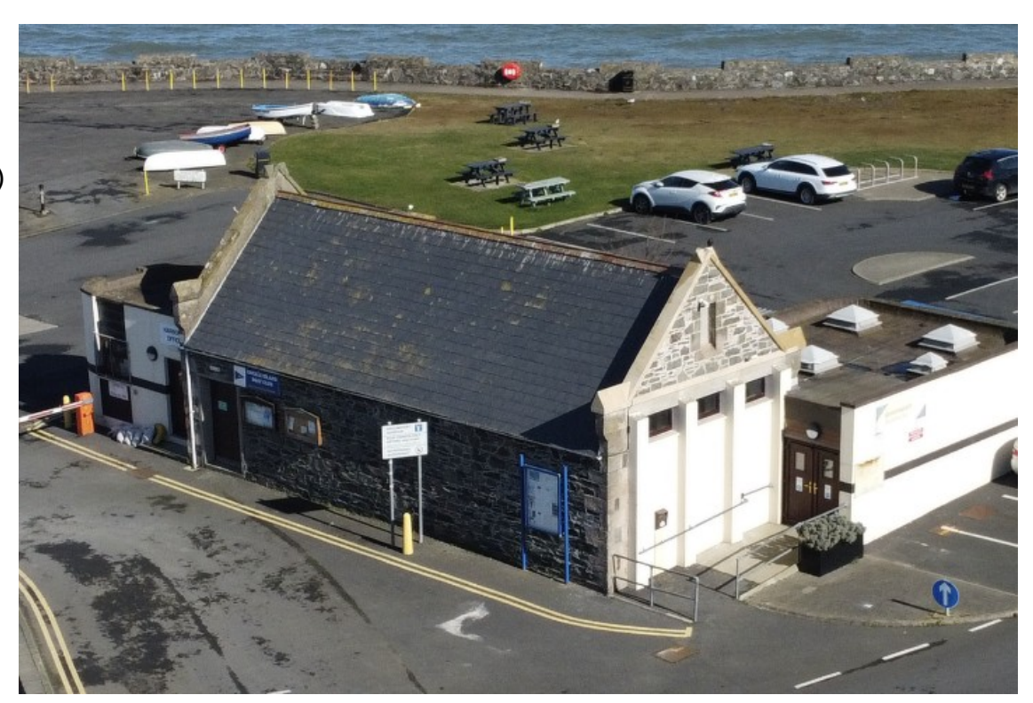
Groomsport Boathouse. The original 1858 building was extended in the 1970s

In 1920, the RNLI closed the Groomsport Life-Boat station.