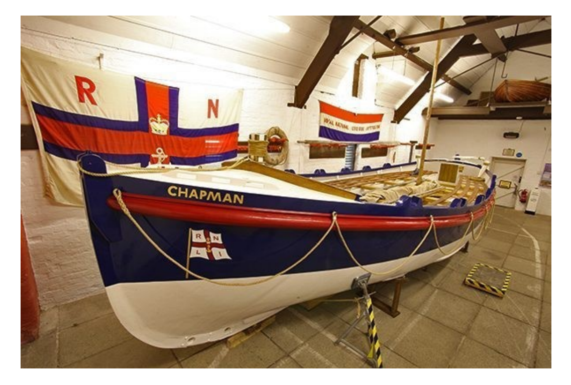
Chapman in Lytham Lifeboat Museum, Lancashire