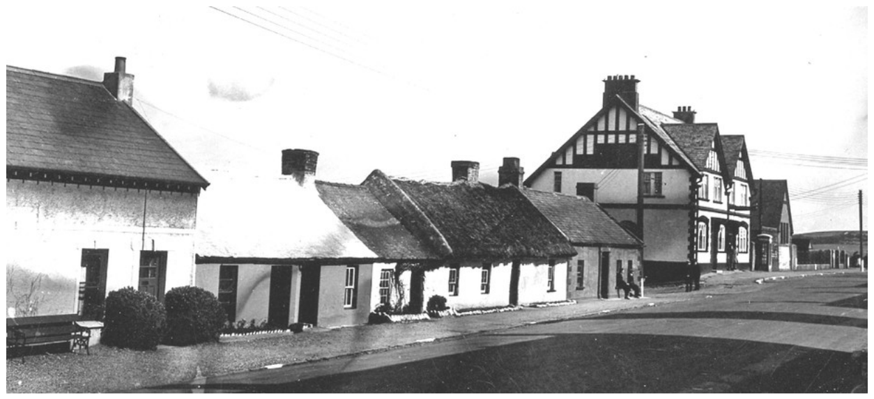
Main Street, 1944

The cottages, many of which were thatched, were very attractive, as the following photograph of Main Street, taken in 1944, shows.