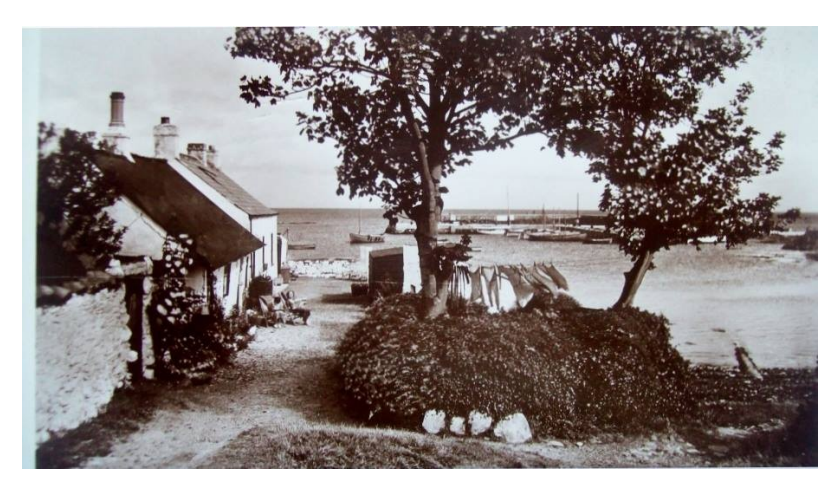
Cockle Row Cottages in the 1950s